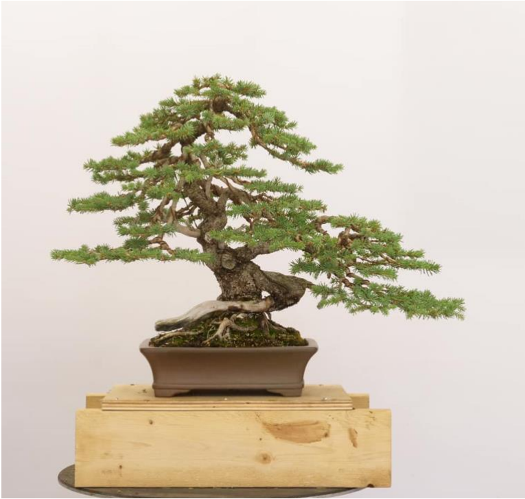
COLORADO BLUE SPRUCE - TODD SCHLAFER