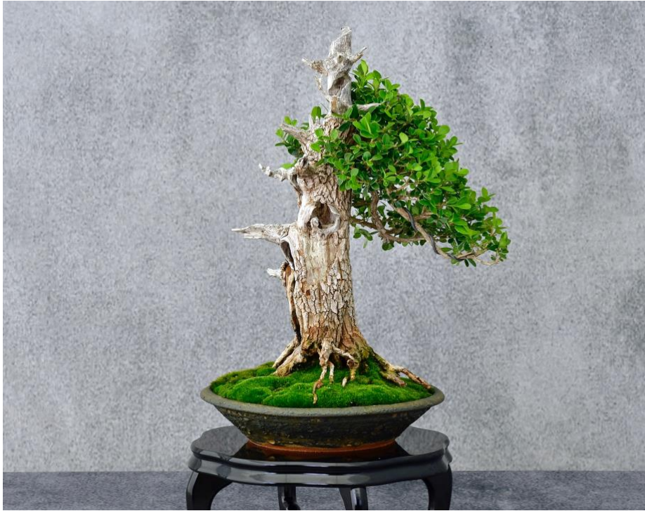
BOXWOOD - BOB RANDALL