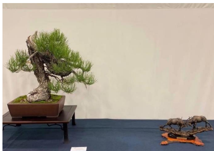
Ponderosa Pine - Back Country Dan