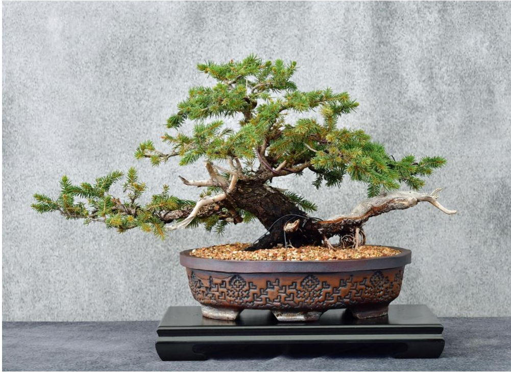
COLORADO SPRUCE - RALPH SCHROEDER IN MEMORIAM