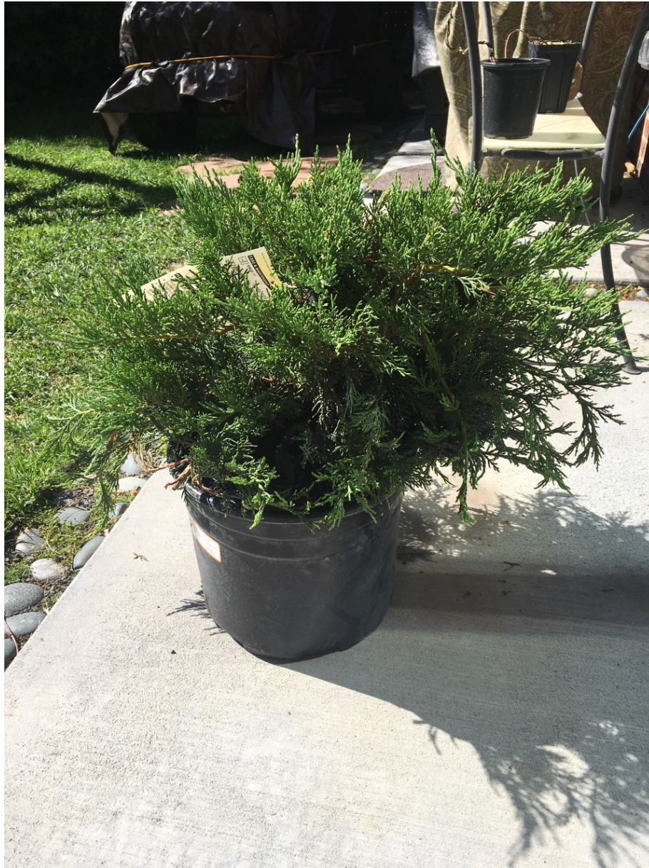
Looks like every other bush on the rack at the box store.

on the shelf. It will make a good bonsai, not an exceptional one. All told, I will likely have a tree worth a couple hundred dollars from an investment of about one tenth of that.