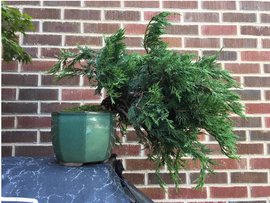
Ready for styling. After root work and potting.

Step 4: I potted the tree with a layer of coarse aeration soil at the base (same composition as the rest of the soil, just a fraction larger). I tied the tree down loosely, then filled the pot with soil. Pushing the soil first in around the tree with my fingers to "bulk-fill" the spaces. Then I tightened the tie-downs snug once I had the tree at the angle which I thought was suitable for the next 2-5 years of training. After this, I filled the pot with more soil and chopsticked in the rest of the soil to eliminate all of the empty space in the container. I top-dressed the surface with mountain moss (to keep the soil from being displaced when watering). All told, a bit more than one hour of root work and potting done. This tree is now ready for the heavy styling work in the coming weeks. The ability to both pot and style a tree in a single season is a huge benefit of nursery stock.