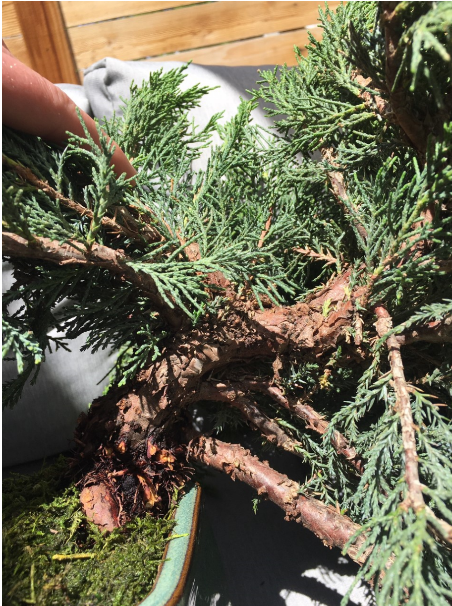
At least the trunk has a bit of interesting movement. Not much else to recommend this stock.

Step one: Assemble tools and usable workspace. Knock it out of the nursery can and start reducing the soil mass with a chopstick. As will most nursery stock, this