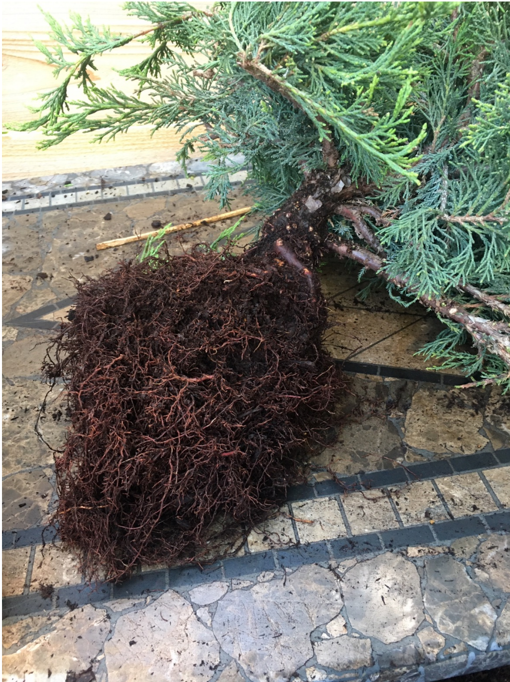
Root mass after working, prior to potting. Lots of fine roots remain. Basal flare identified.

with the same inside-to-outside chopstick technique and removing unwanted roots with a scissor, assuring sharp clean cuts. It was helpful to have identified a usable cascade style pot and to dry fit the root mass periodically to see if I had reduced enough. I think all together, I took off about 50% of the existing root mass, focusing on removing long, stringy roots that were coarse and without a large mass of fine feeder roots.