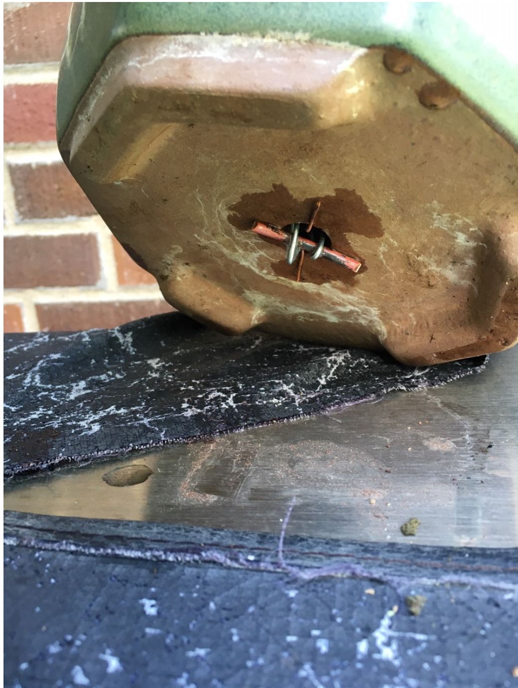
A common tie-down wire problem: remedied.

Step 3: Prepare the pot with drainage screen and tie down wires. This pot posed a problem (which is a common one) with only a single drainage hole at the bottom and no other areas to string tie wires. I will omit the primer on proper potting here but show you how I tied this tree down using a bar of heavy gauge copper wire, clipped to length and stainless-steel tie-down wire (will not stretch). I inserted a chopstick into the root mass above as an anchor to tie half the tree down (again, a topic for another message).