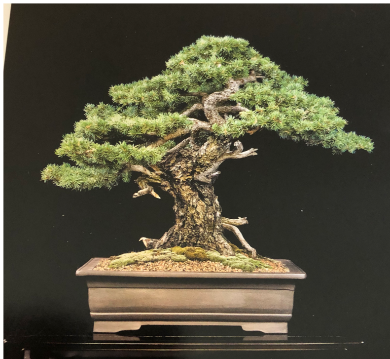
COLORADO BLUE SPRUCE WALTER BUCK