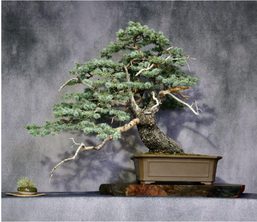
"BIG BLUE" - WILL KERNS