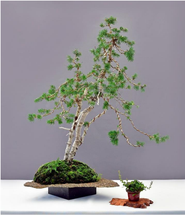
SUB-ALPINE FIR – MIKE BRITTEN