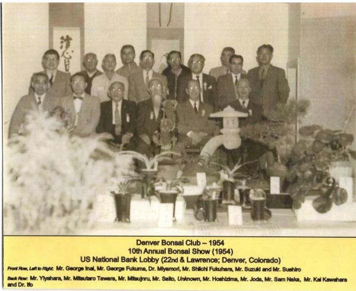
First show 1954