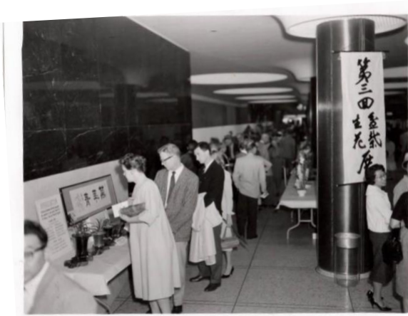
Sometime in the late 1950s