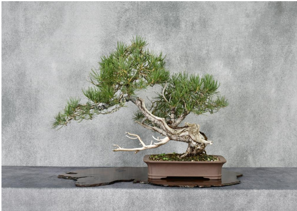
PINION PINE - PAUL KOENNING