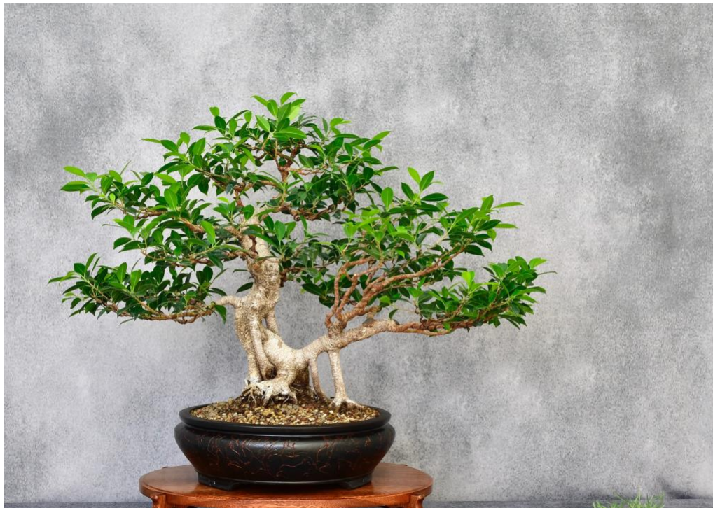
GOLDEN GATE FICUS - DAVID MCPETERS