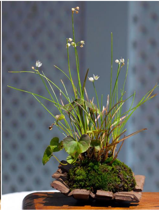
KUSAMONA - YOUNG CHOE